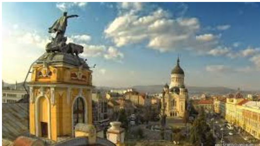
The National Theatre & The Orthodox Cathedral