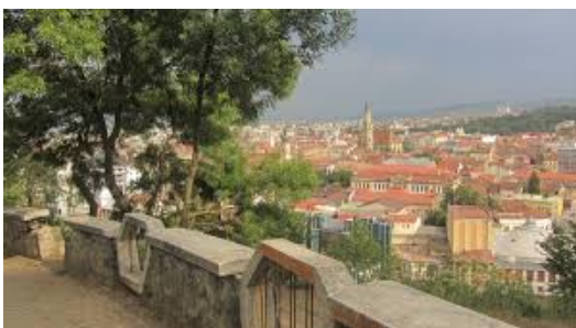
Belvedere & Cetățuia park