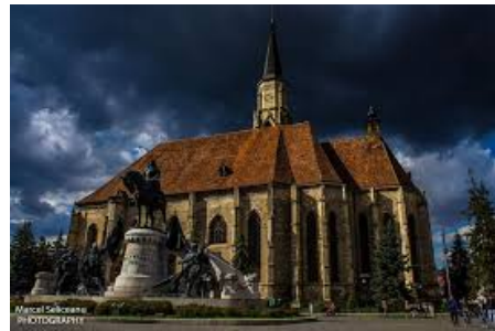
Uniri Square & The St Mihail Cathedral