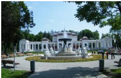
The Park & The Casino